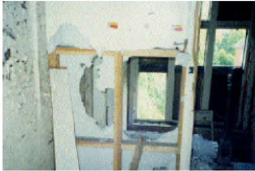
A severely damaged wall partition made of asbestos insulating board.