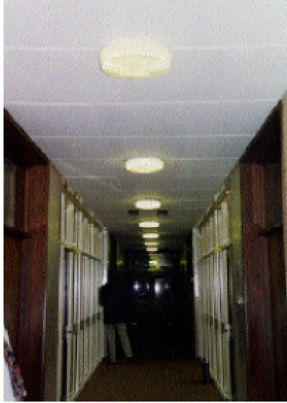
A typical asbestos insulation board ceiling.